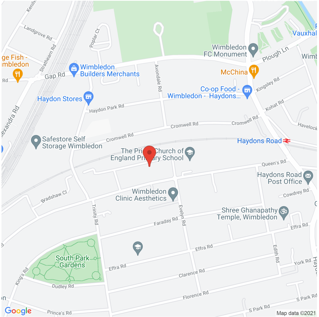
To open map in your browser please click here .