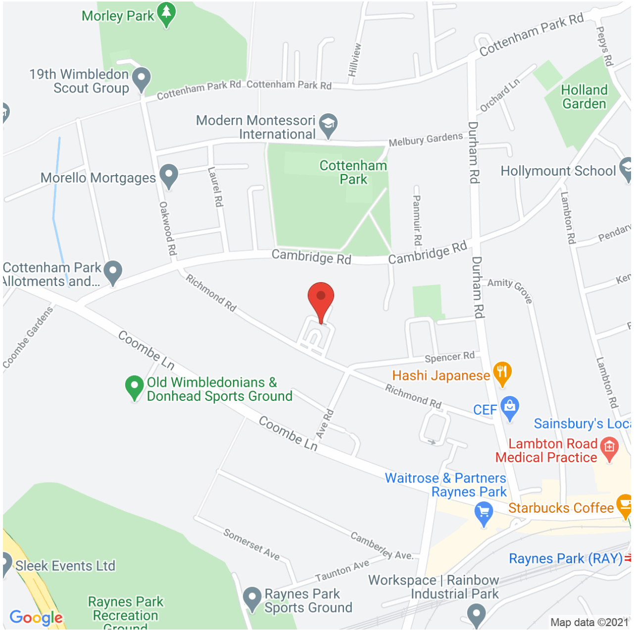
Map supplied by Google Maps. To open map in your browser please click here .